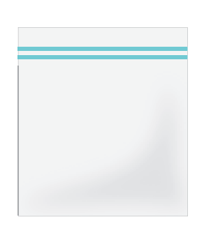
Simple cut-off seal weld